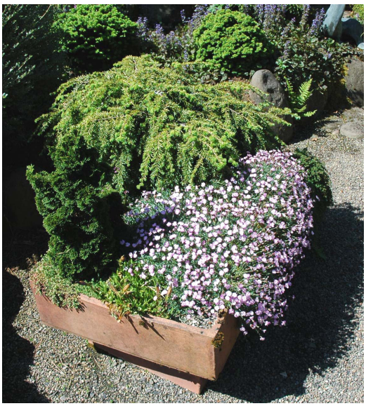
Photos 6 and 7 are examples of trough garden containers and plantings.