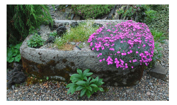
Water-absorbing polymer products are marketed for containergrown plants that claim to reduce watering frequency. These highly water-absorbent products are mixed in the potting soil at planting. Most research has shown limited benefits, if any, of using these products in container soil mixes.

There are a variety of commercial potting soils that vary from dense and very moisture-retentive to light and well-drained. Your choice of potting soil will depend on the type and size of plants you use and the location of the container. You can use a commercially available soil water-content monitoring device to determine when to water your plants; or you can easily determine water content by probing the soil with your finger or by lifting the container and judging soil water content by the relative weight of the container. In most cases, you will want your soil to be moist/wet immediately after watering and then become partly dry before you water again. Roots need air (oxygen). If a potting soil is kept too moist, then the pore spaces in the soil will be filled with water and roots will suffer from a lack of oxygen. Most mineral soils (the soil native to your garden) are not suitable for containers since they retain too much water. An exception to this is a sandy soil.