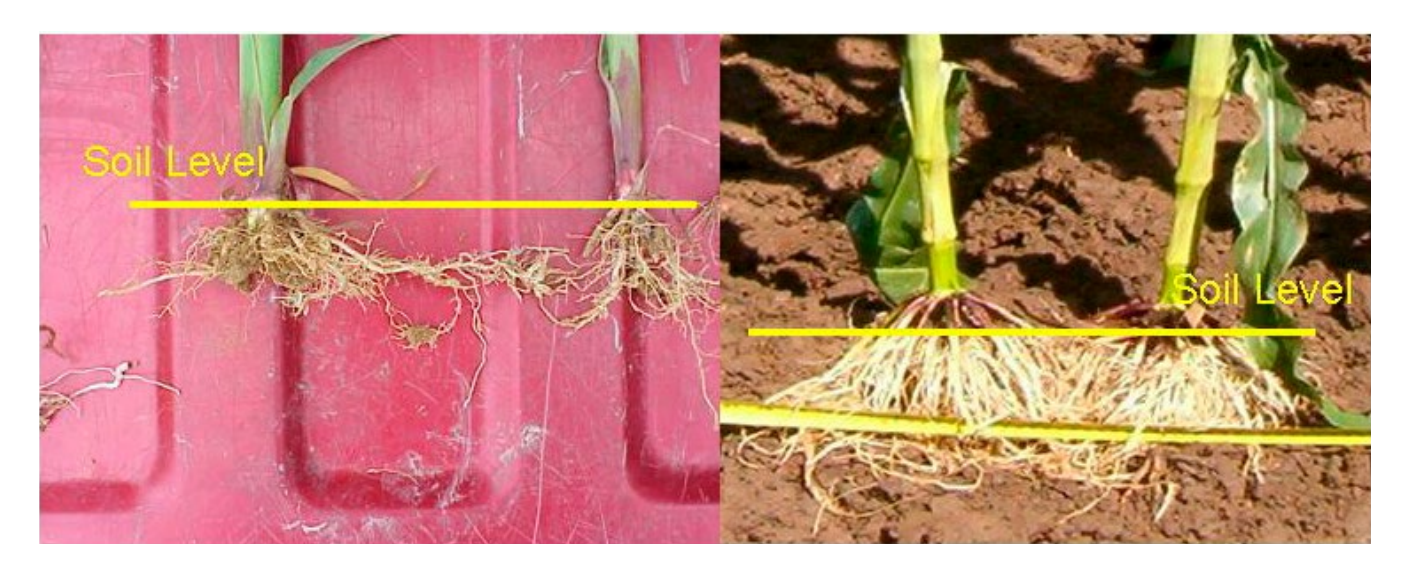
Figure 1. Corn root growth limited by soil compaction (left) and healthy roots from noncompacted soils (right).

located there. In a typical soil, air and water make up about 50 percent of the total soil volume while soil particles make up the other 50 percent. However, this can change dramatically as soil particles are pressed together and the air is squeezed out. Generally, the largest spaces are eliminated first, taking away the path of least resistance for air and water movement as well as for root penetration. Soils with a mixture of textures (some sand, silt, and clay) are more susceptible to compaction than those with homogenous texture, when exposed to the same compactive force.