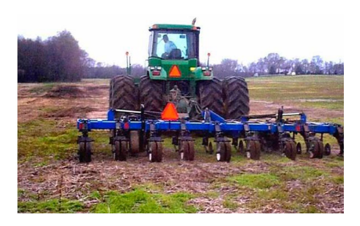
Figure 2. Deep tillage using a no-till ripper. Note the minor soil disturbance and large amount of residue remaining on the soil surface.

by animals when estimating the residue cover required to prevent erosion.