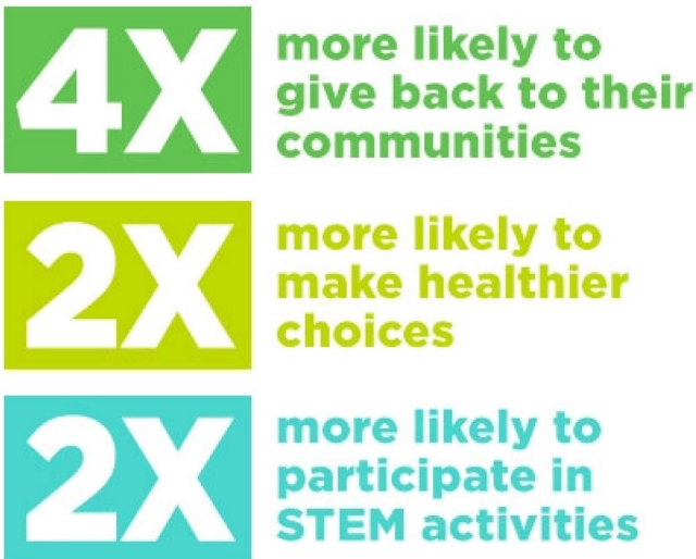
Figure 1. Ways 4-H benefits young people.