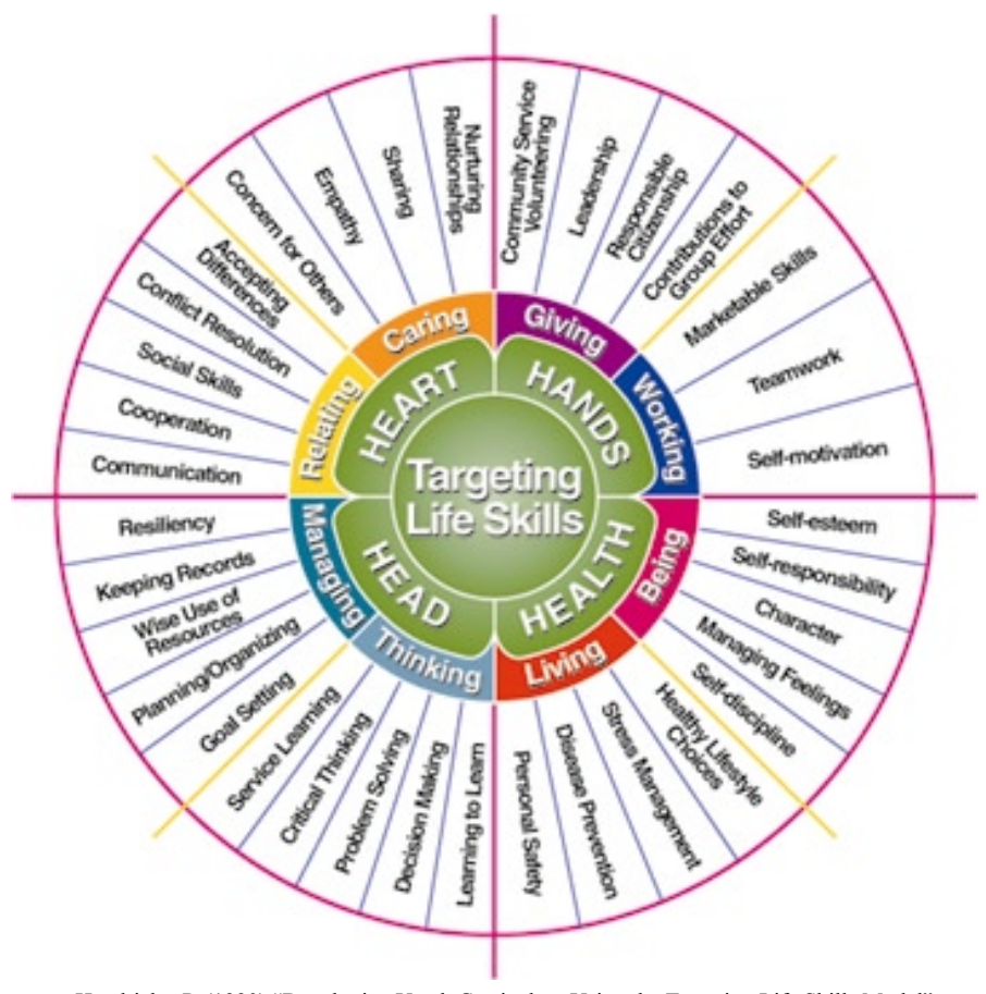
Hendricks, P. (1990) "Developing Youth Curriculum Using the Targeting Life Skills Model" http://www.extension.iowastate.edu/4h/skls.eval.htm