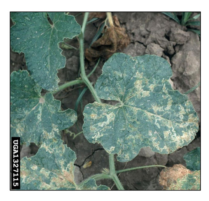
Figure 3. Cantaloupe leaves with numerous agromyzid leafminer mines.

Larvae make long, winding, light-colored tunnels in leaves. Sometimes the mines coalesce into more blotchy shapes. Photosynthesis is reduced in heavily mined leaves (Fig. 3). Mines reduce the aesthetic value of ornamental plants. Damage usually is not appreciable in the northern states as the insects do not have as many generations as in the warmer, more southern states.