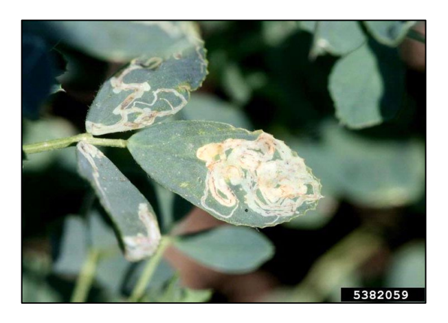
Figure 2. Damage by alfalfa blotch leafminer on alfalfa.

Agromyzid leafminers have a complete life cycle of egg, larval, pupal, and adult stages. Females deposit eggs within living leaf tissues of host plants. Larvae hatch from eggs in a few days and begin feeding on internal leaf tissues (Fig. 2), leaving the upper and lower layers intact. The larvae create wider tunnels as they develop in size. Mature larvae either emerge from inside the leaf and drop to the soil where they pupate in soil crevices, or remain and pupate on the leaf. The time span from egg to adult is less than three weeks under optimum conditions, so multiple generations of these insects can develop over a summer.