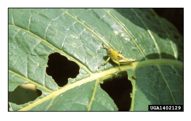
Figure 3. Typical chewing damage to a leaf by grasshopper feeding.

Grasshoppers have chewing mouthparts and they feed on any available vegetation (Fig. 3). When abundant, they may destroy entire plantings of crops such as lettuce and potato. Damage may be more severe in irrigated crops during dry periods as the grasshoppers are attracted to the moisture found in fresh food.