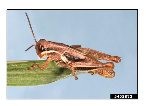
Figure 2. Typical grasshopper nymph with undeveloped wing pads.

Grasshopper nymphs look very much like the adults, but have wing pads instead of developed wings (Fig. 2).