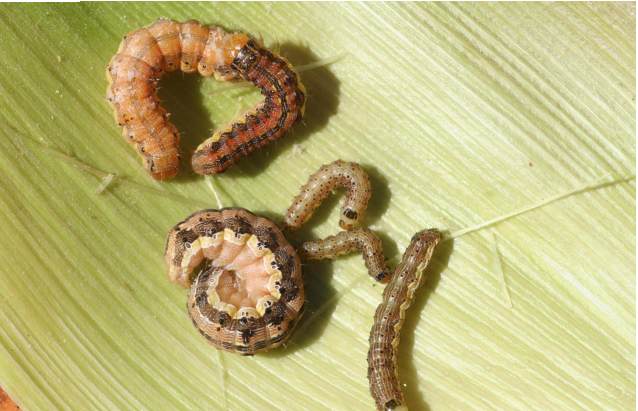
Figure 3 Corn earworm larvae.

~15 days, and can be found flying throughout summer and into early fall months. A single female moth can lay as many as 3000 eggs. Corn earworm eggs are laid singly, are cream to pale green colored, are ~1/2 mm in size, and have a ribbed dome appearance. Eggs hatch ~3-4 days with reddish brown bands appear prior to hatching. Corn earworm larva are variable in color, ranging from green to brown to pinkish. Larvae have four