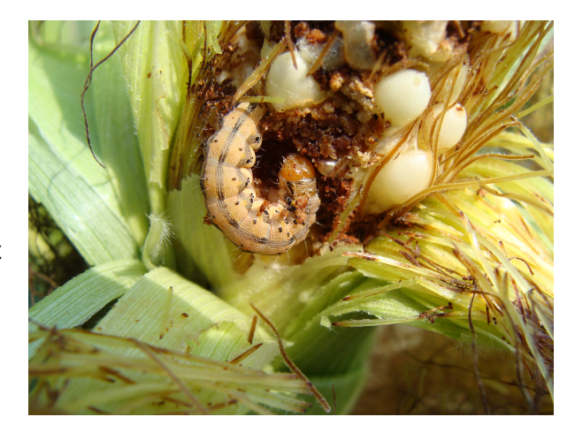
Figure 6. Corn earworm on sweet corn.

Monitoring Thresholds: No sampling protocol is established for sweet corn, but methods for monitoring have been suggested (Hoffmann et al. 1996). On tomato, 20-30 plants should be observed per field for any sign of eggs, which are generally laid on leaves below the highest flower cluster (Kuhar et al. 2006). Adults can be monitored by blacklight and pheromone traps. If more than 20 moths are caught per night the insecticide treatment should be considered.