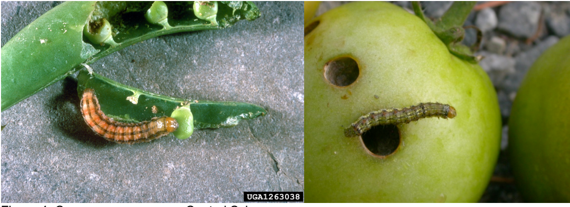
Figure 4. Corn earworm on pea.

Corn earworms have a very broad host range and can feed and develop on >300 different host plants including many vegetable crops.