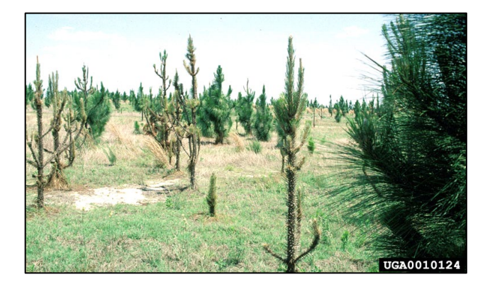
Figure 3. Conifers damaged by redheaded sawfly larvae.

The redheaded pine sawfly is the most widespread and destructive of the pine sawflies and is considered an important pest of ornamental, forest, and especially plantation trees. It usually feeds on young trees, preferably 0.3-4.6 m tall. Trees growing under stress in shallow soils, very wet or dry sites, or under stress from competing vegetation are especially susceptible to infestation and heavy defoliation. Outbreaks occur periodically and tend to subside after a few years of heavy defoliation. Severe outbreaks have resulted in the death or deformity of young pines.