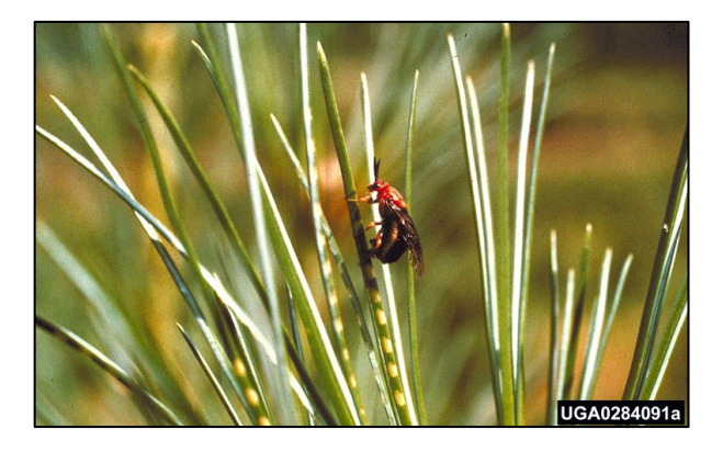
Figure 1. Adult female redheaded sawfly ovipositing in a pine needle.

Adult sawflies look similar to true flies, but have two pairs of wings instead of one pair. Adult females are larger (6-9.5 mm in length) than males (5-6.5 mm). Females have a red head and thorax, with black wings and a lighter-colored abdomen. Males are darker in color, with broad, feathery antennae.