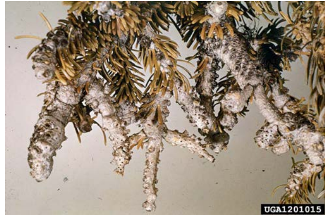
Gouting caused by Balsam woolly adelgid.

Forest Situations: In forest situations, silvicultural and management techniques can be used to reduce adelgid populations and damage. Tree stress may be minimized by thinning overstocked stands, by fertilizing sites of poor nutrient quality (although some nitrogenous fertilizers such as urea can increase the numbers of this pest), and by replanting or encouraging more tolerant tree species and varieties. A damage-hazard rating system based on site and stand characteristics associated with severe adelgid damage can be used to aid in management decisions (Page, 1975). The main variables used in the system are site elevation, soil moisture regime, percent balsam fir by basal area, total basal area of balsam fir, and stand age. In general, lower elevation, dry sites with > 40 percent balsam fir, and > 45 years old are most susceptible. Trees > 25 and < 45 years old are moderately susceptible, and trees < 25 years old are least susceptible.