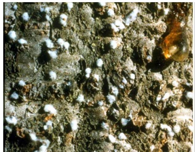
Balsam woolly adelgid on bark

laying > 200 eggs in a cluster near her body. The first instar "crawlers," reddish-brown and about 4 mm in length are the only stage of the insect capable of moving and dispersing. Once the crawler finds a suitable feeding location, it inserts its tube-like mouthparts into the bark of the host and remains there for the rest of its life. The second and third instars are about 0.5 to 0.65 mm in length, respectively, and closely resemble the adult. Hemiptera: Adelgidae, Adelges piceae (Ratzeburg)