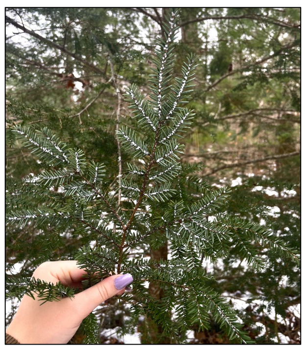
Figure 3. Hemlock woolly adelgid covering a branch of Eastern hemlock.