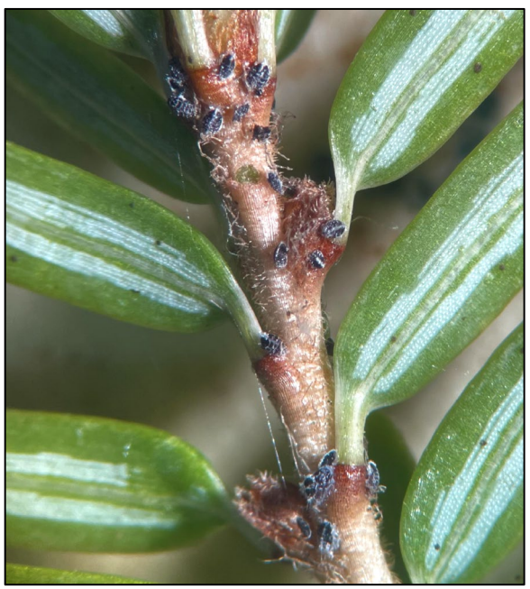
Figure 2. Nymphs settling into the base of needles.

Immature nymphs and adults damage trees by feeding on storage cells near the base of needles at their attachment point on the twigs (Fig. 2). The tree loses vigor and prematurely drops needles, to the point of defoliation, which often leads to death. If left uncontrolled, the adelgid can kill a tree in as quick as four years.