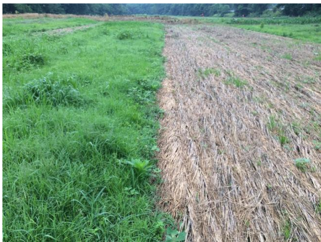
Figure 6. Comparison of weed control from no-cover (left) vs. fall-planted cereal rye cover (right) on June, 8 weeks after termination with glyphosate.

Cover crops are most effective for weed suppression (Figure 6) when high biomass levels (>7500 lbs dry biomass per acre) are achieved (Mirsky et al. 2011). To ensure high biomass levels, early planting of fall cover crops is crucial. Delayed cover crop termination can also help to increase biomass levels. Termination of cereal rye cover crop about May 1 typically maximizes biomass production. Greenhouse studies in Virginia have shown a 77% Palmer amaranth stand reduction from 9000 pounds per acre of cereal rye biomass (Rector and Flessner 2018).