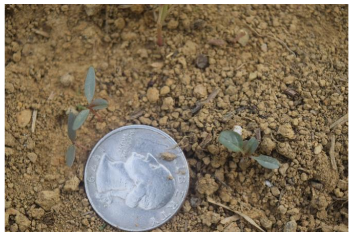
Figure 1. Palmer amaranth cotyledons.

Palmer amaranth cotyledons are linear to lanceolate in shape (Figure 1). Palmer amaranth can be differentiated from other pigweed species, such as redroot pigweed and spiny amaranth, by its lack of hair and long petiole length (Figures 2 & 3). Palmer amaranth bears separate female (Figure 4) and male flowers (Figure 5). Female flowers can be distinguished by their sharp bracts.