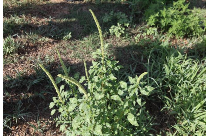
Figure 5. Male Palmer amaranth seed head.