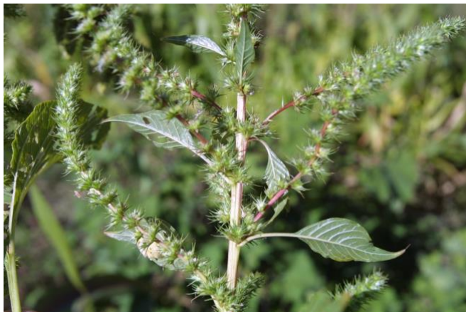
Figure 4. A female Palmer amaranth seed head.