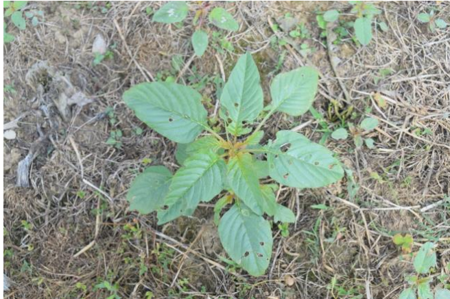
Figure 2. Palmer amaranth leaves are ovate to diamond shaped.