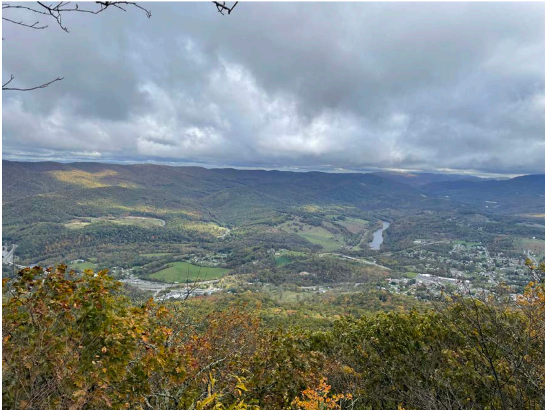
Figure 1: Angel's Rest in overlooking the town of Pearisburg.