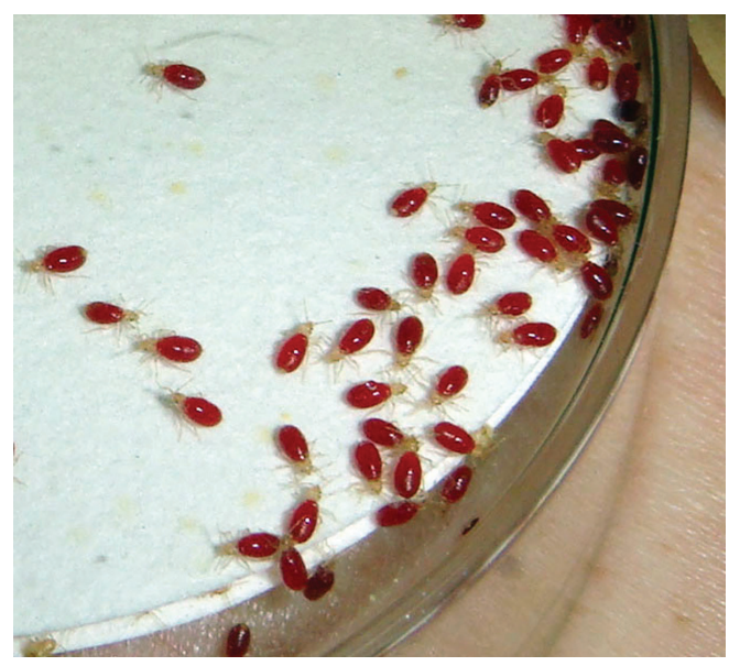
First instars after feeding

The time it takes any particular bed bug nymph to develop depends on the ambient temperature and the presence of a host. Under favorable conditions, such as a typical indoor room temperature (>70° F), most nymphs will develop to the next instar within 5 days of taking a blood meal. If the newly molted instar is able to take a blood meal within the first 24 hours of molting it will remain in that instar for 5-8 days before molting again. At lower temperatures (50° F - 60° F), a particular instar may take two or three days longer to molt to the next life stage than a nymph living at room temperature. However, if a bed bug nymph does not have access to a host, it will stay in that current instar until it is able to find a blood meal, or it dies. The time for a bed bug to develop from an egg, through all five nymphal instars, and into a reproductive adult is approximately 37 days.