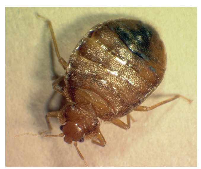
Unfed or starved adult bed bug

The most recent studies indicate that a well-fed adult bed bug held at room temperature (>70° F), will live between 99 and 300 days in the laboratory. Unfortunately, we do not know exactly how long a bed bug might live in someone's home or apartment. No doubt it will be at least several months but conditions are usually more challenging for the bed bugs living in human dwellings than they are in the laboratory (it is hard to find food, there are fluctuations in temperature and humidity, insecticides may be present, it is easy to get crushed etc.) and these conditions will have a negative impact on bed bug survival.