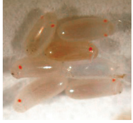
Bed bug eggs

average adult female will live about one year. If she is able to feed every week, she will produce many more eggs in that year than if she is only able to feed once a month.