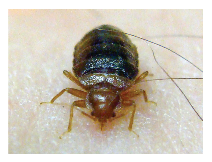
Bed bug feeding

when the human host is typically in their deepest sleep, that bed bugs like to feed.