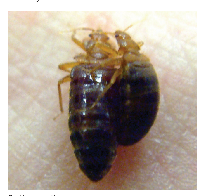
Bed bugs mating

In practical terms, this means that a single mated female brought into a home can cause an infestation without having a male present, as long as she has access to regular blood meals. The female will eventually run out of sperm, and will have to mate again to fertilize her eggs. However, she can easily mate with her own offspring after they become adults to continue the infestation.