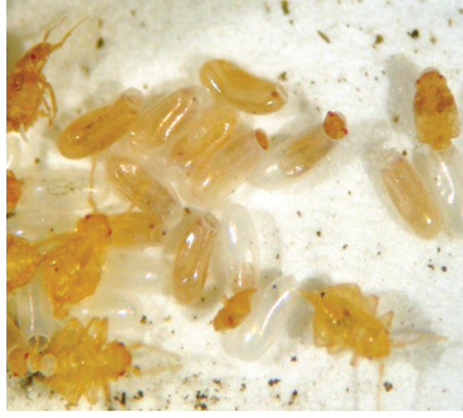
Bed bug eggs hatching