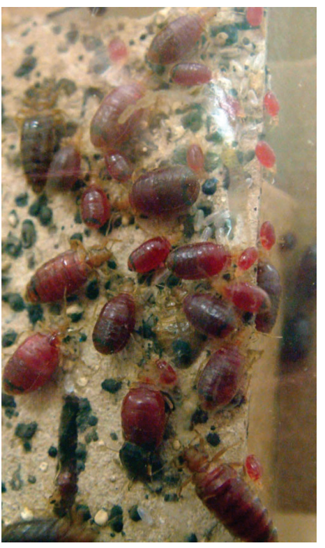
Fed bed bugs

The lifecycle data presented in this publication is based on research conducted using bed bugs collected from apartments within the state of Virginia. These populations have documented resistance to pyrethroid insecticides. Laboratory studies have indicated that resistant bed bugs have a shorter developmental time (several days), shorter life spans and lower levels of egg production than bed bugs that are not resistant to insecticides. At the time of this writing, practically all "natural" bed bug populations collected in Virginia have been found to be a least somewhat resistant to pyrethroid insecticides.