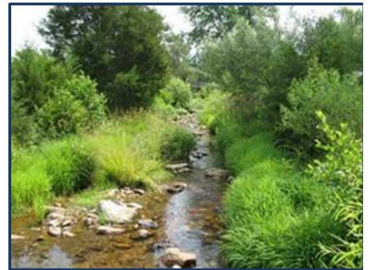
A well buffered "Smith Creek" in Shenandoah..

The importance of riparian forest buffers has been recognized for many years. Planting more forest buffers in Virginia is a goal promoted by all agriculture and natural resource related agencies and many nonprofit organizations as well. The Virginia Department of Environmental Quality has a list of "impaired" (i.e. not healthy) streams on their website. You can find out if any streams in your area need help by going to: www.deq.virginia.gov and query "impaired streams". If you have streams in your community listed with sediment or other impairments, more riparian forest buffers may help the situation. Both the Chesapeake Bay and Southern River regions of Virginia have needs for more forest buffers along water features.