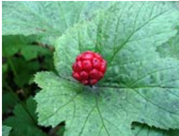
Goldenseal, Hydrastis canadensis

It's a good thing that our society has elevated the status of farmers from the "just a farmer" kind of attitude to a recognition of the business savvy and land management skills it takes to successfully cultivate a piece of land to produce food, decorative material, medicines and more.