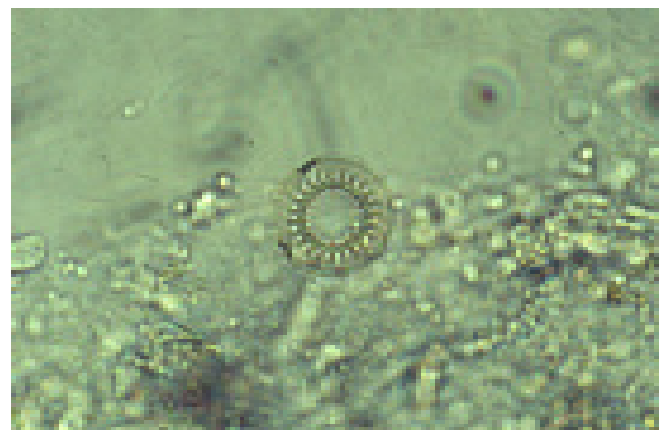
Figure 2. Trichodina sp. in skin scrape of fish.

There are species of trichodinads that inhabit freshwater, brackish water and salt water. Some have a preference for the gill area, others for the skin, and others