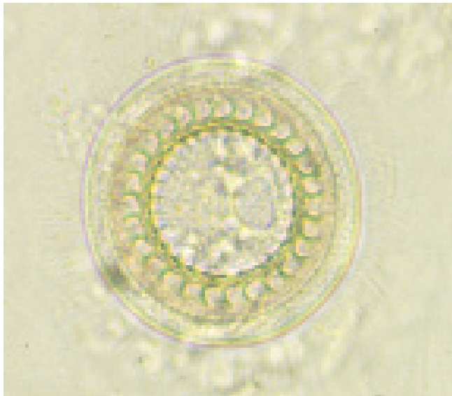
Figure 1. Trichodina sp., note prominent “tooth-like” internal ring.

Trichodina spp. are a group of dorsal-ventrally flattened oval ciliated protozoan parasites of marine and freshwater species of finfish. A readily distinguishable characteristic of these organisms is the presence of a prominent denticular or “tooth-like” internal cytoskeleton ring. There are four additional genera of trichodinads which are similar in description and life cycle. While small numbers of these organisms on a fish generally do not cause much of a health problem, large numbers can cause moderate to serious pathology and ultimately, death of fish. Small fish and fry are especially susceptible, and mortality can occur quickly if undiagnosed.