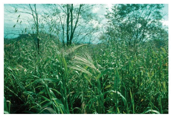
Figure 1. Fast-growing annual grasses, most of which are annuals, are often seeded as "nurse crops" to protect the perennial grasses and legumes that are generally slower to establish. These fast-growing annuals also provide organic matter to the soil as they decompose after dying off.

Fast-growing annual species (such as oats or millet) may be included in reclamation seed mixes as companions to perennial grasses and forbs. These fast-growing annuals are often called "nurse crops" because they provide protection for the perennial species that are