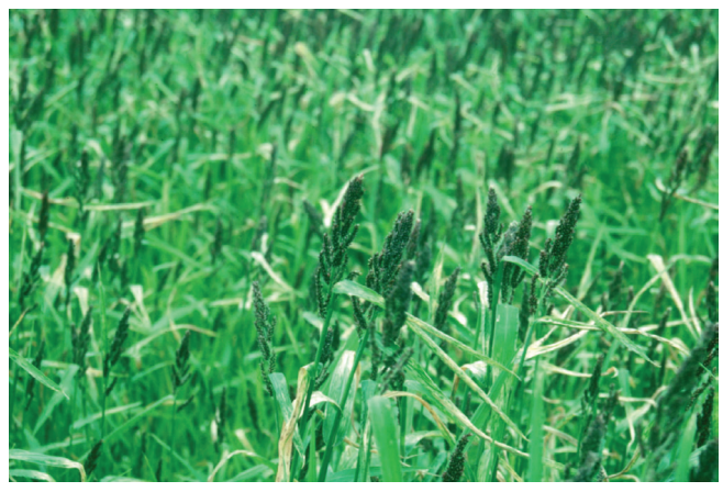
Figure 2. Millets are commonly used as nurse crops during summer seedings. Japanese millet (shown here) is a prolific seed producer that attracts birds and other wildlife to the reclamation area.