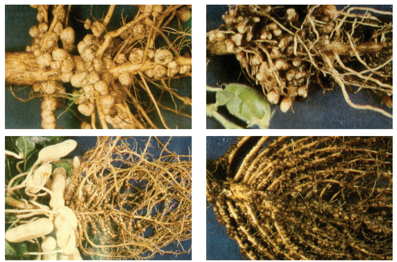
Figure 3. Nodules formed by Rhizobium bacteria on the roots of several legume species. When nodules are present, legumes can "fix" nitrogen from the air, satisfying their own nitrogen nutrition requirements and providing excess nitrogen to nonlegume plant species.

A few of the more important legumes are described in more detail below.