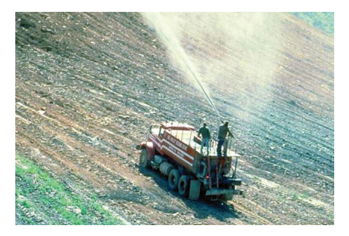
Figure 5. A hydroseeder applying seed in a fertilizer slurry while revegetating a surface coal mine.