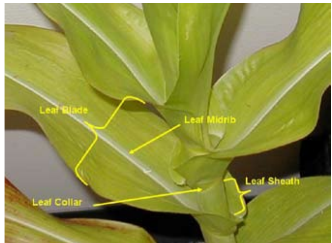
Figure 1. Photo of a corn plant at the V10 stage when the collar of the tenth leaf (the one growing toward the upper left) has become evident. The collar of leaf nine is labeled, and the collar of leaf eleven is not yet visible.

Agronomists at Iowa State University developed a handy way to describe corn's very predictable pattern of growth. They named several easily observed events, or stages , that occur in every plant's life. The markers for each stage are readily seen with the naked eye – no need to bring a magnifying lens to the field and no need to pull plants up to see what is going on underground. Each developmental (growth) stage has a word descriptor and a shorthand abbreviation (Table 1). The first several stages are keyed to leaf number and vegetative development, particularly the development of the leaf collar (Figure 1). The later stages rely on easily identified reproductive events, such as the development of tassels and silks and the advancing maturity of the kernels. More information and photos are available on the Web at: http://maize.agron.iastate.edu/corngrows.html .