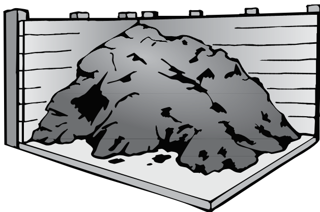
Example of mixing/storage area with buck wall.

Compost will decompose more efficiently if the mix is uniform. Starting with a uniform mix is even more important in the case of static piles, since they will not be turned during the decomposition process. Some farms utilize a temporary storage and mixing area to aid in this process.