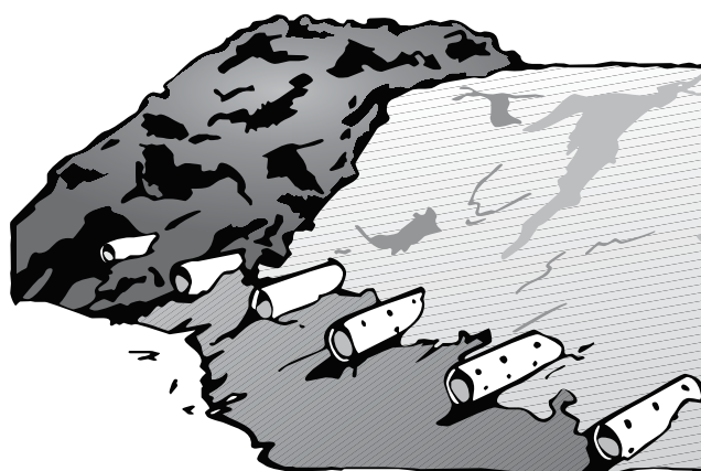
Aerated static pile with perforated PVC pipes.

Compost-pile design and storage facilities will depend on the size of the operation and the equipment available. For a farm with two to six horses, small static piles, which use perforated PVC pipes to draw in air and don't require turning, may be ideal. While not necessary, the use of multiple bins can allow separation of distinct "batches." In this situation, horse manure should be piled approximately five to eight feet high with a base that is two times the width and length of the height. For example, a 10-foot-by-10-foot bin could accommodate a pile that is five feet high. PVC pipes should be placed after the pile is about one foot high and so that the ends remain visible as more manure is added.