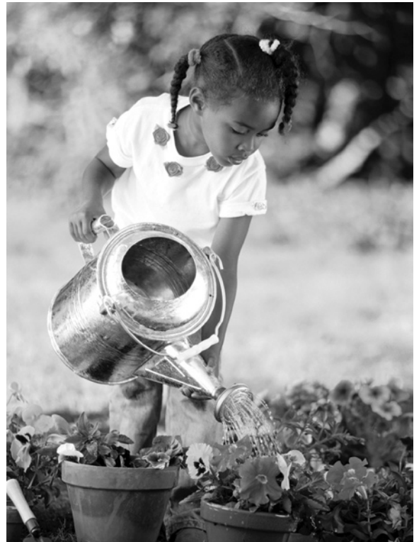
In healthy families, children are required to take on appropriate roles of responsibility within the family.

In healthy families, every member is responsible for fulfilling certain roles. These roles are spread among the various members so that no one is asked to take on too many responsibilities. Problems arise if one family member is forced to fulfill too many roles. An example of this is when fulltime working mothers are expected to take care of the children and complete the majority of household tasks with little assistance from other family members. It is important to discuss, as a family, each member's understanding of the roles he or she has been assigned. If someone feels overburdened and unable to fulfill that particular role, then changes may be needed.