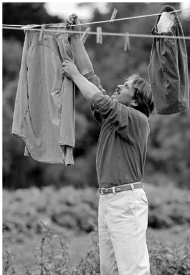
Flexibility in roles is essential in a healthy family.

Flexibility in roles is essential in a healthy family. Family roles naturally change over time. They also may change during times of crisis, such as when a family member becomes seriously ill or unexpectedly dies. The difference between healthy and unhealthy families in these situations is the healthy family's ability to adjust and adapt, which often requires a temporary or permanent shift in roles. In the case of illness or death, it is sometimes necessary for other family members to take on additional roles (e.g., becoming a financial provider).