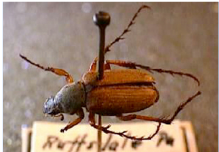
Rose Chafer.