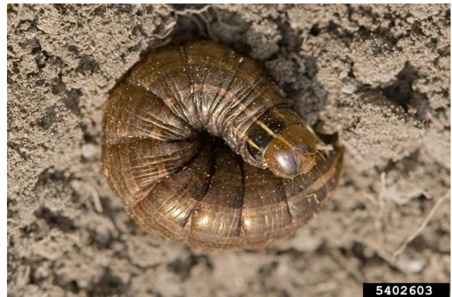
Bronzed Cutworm.

CHEMICAL CONTROL: If cultural control fails, follow the label instructions and precautions for pre-planting treatment of cutworm for Beans, Beets, Cabbage, Carrots, Cauliflower, Celery, Collards, Cucumbers, Endive, Kale, Lettuce, Lima Beans, Melons, Muskmelons, Onions, Parsley, Parsnips, Peas, Peppers, Potatoes, Radishes, Snap Beans, and Sweet Corn.