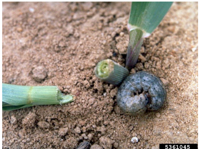
Black cutworm.