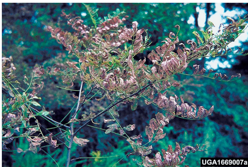
Locust leafminer damage to leaves.

Soybeans rarely have locust leafminers reaching economic thresholds and control is only warranted if defoliation of the vegetative stages reaches 35 percent or more. Most common soybean insecticides used at a low rate will give good control.