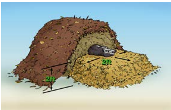
Figure 1: Composting Pile Construction Drawings by Bill Davis, Courtesy of Cornell Waste Management Institute

Composting is a controlled biological decomposition process that converts organic matter to a stable, humus-like product. The microorganisms that break down organic matter are naturally occurring (no special microbes need to be added to the pile). The combination of microbical activity and heat generated during the composting process destroy pathogens. Please note that many farmers think that composting involves placing the mortality in a hole with woodchips or other organic matter. This is not the case. As shown in Figure 1, composting occurs above ground.