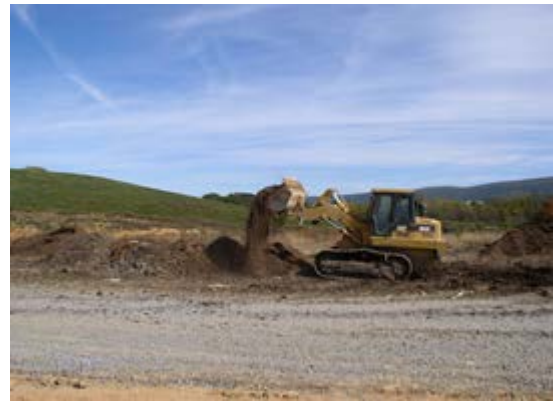
Composting Mortality at the Shenandoah County Landfill

Some county landfills accept animal mortality from farms in their locality. Landfills will either bury or compost the animal mortality. Availability, price and drop-off times will vary by county, so contact your local landfill or Extension Office for more information.